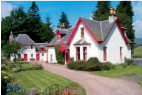
Corrydon Lodge – Perthshire, Scotland

Namdar Décor Candles are internationally known as a luxury home décor fragrance company. Hand poured in Dallas, Texas, these candles come with authentic gemstones certified by Arkenstone, one of the world's leading fine mineral and geode curators. Two gift baskets donated by House of Namdar (Value: $500 each)