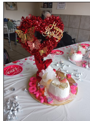
Left: Crystal's party had a Valentine's Day theme including the beautiful Valentine cake