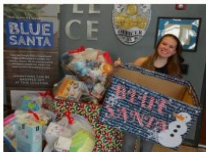
ASTRA Club of Salado High School - Collected stuffed animals for Blue Santa benefiting the local police department.