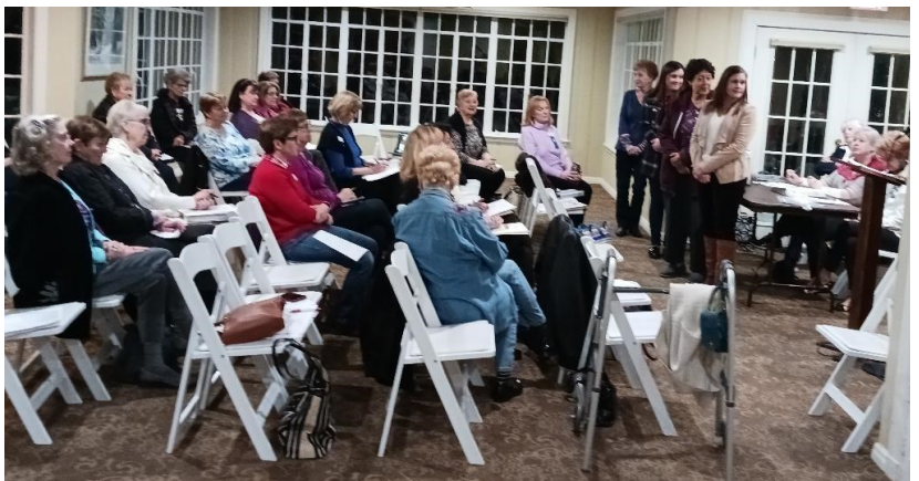
Altrusans look on as new members are initiated