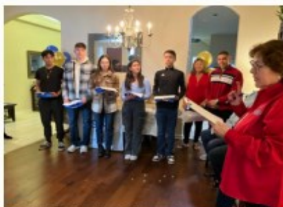
ASTRA Club of San Antonio, TX - Election of Officers