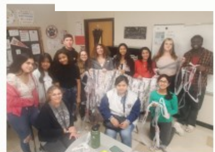
ASTRA Club of Belton High School - Making mats for the homeless out of plarn "plastic yarn".