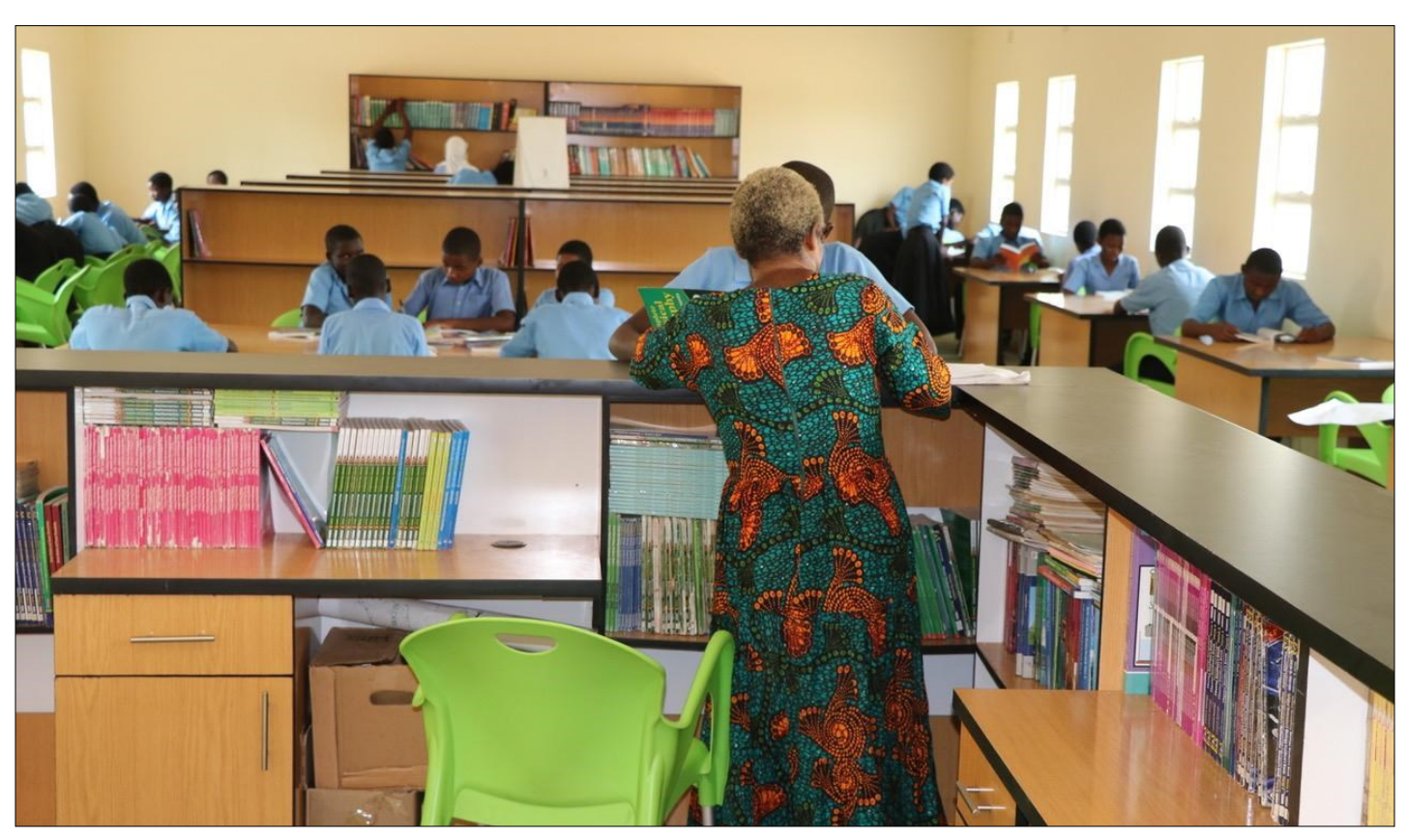
Look what we have helped to make possible. This says it all.