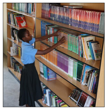
Choosing a Library book