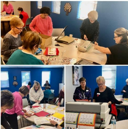
Busy Altrusans All!