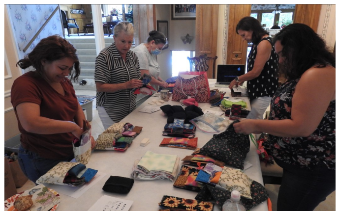
District Nine Altrusans assemble Days For Girls hygiene kits

The project can be evaluated by viewing the effectiveness of having all of District Nine involved in the project. This project not only reached our goal of 400 kits but surpassed it with a final count of 700 kits. One hundred kits are going to a women’s correctional facility in Freetown, Sierra Leone. A total of eight cases containing 194 kits were shipped to Beirut, Lebanon to comply with an urgent request from Days for girls Lebanon Enterprises to help meet the tremendous needs due to the Port explosion disaster. 95 kits are going to Fundacion Familia Maya, in Guatemala. 198 kits will be distributed by high school counselors to students in Lewisville and Highland village, Texas, who are helping a large immigrant population from Burma, and 113 kits are still to be distributed. ... An estimated 200 kits can be assembled from extra kit components not needed to complete our project, that have been donated to the Uganda Days for Girls Enterprise in Kumpala, Uganda. The mission of this Enterprise is to develop a sustainable Days for Girls business model to allow women and girls the opportunity to make and sell the kits for themselves.