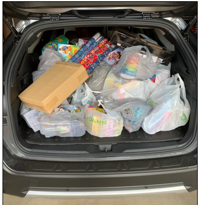
Two Cars – a Subaru outback and an Odyssey Van are filled to over-flowing with toys for the Santa Program at NETWORK thanks to the generosity of Altrusa Richardson