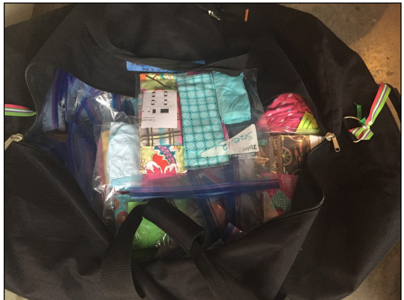
Above right: A bag being packed for shipment