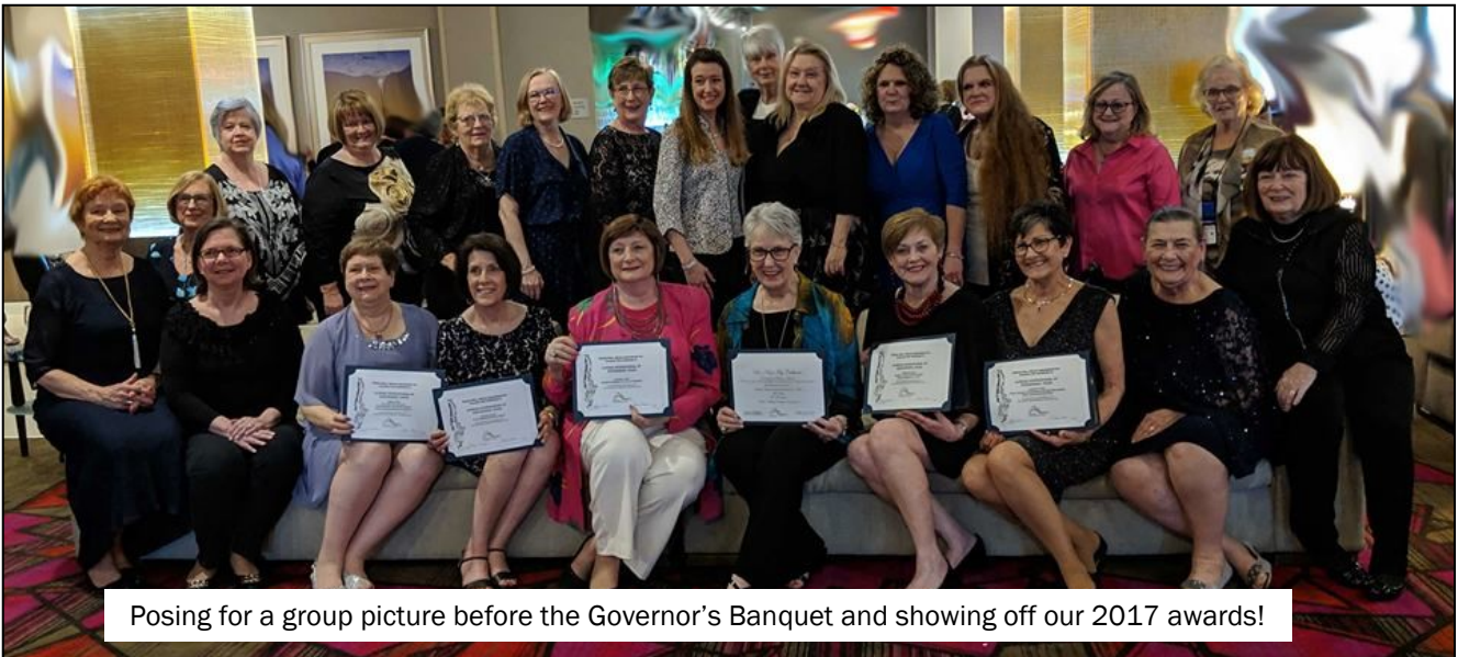
Posing for a group picture before the Governor's Banquet and showing off our 2017 awards!