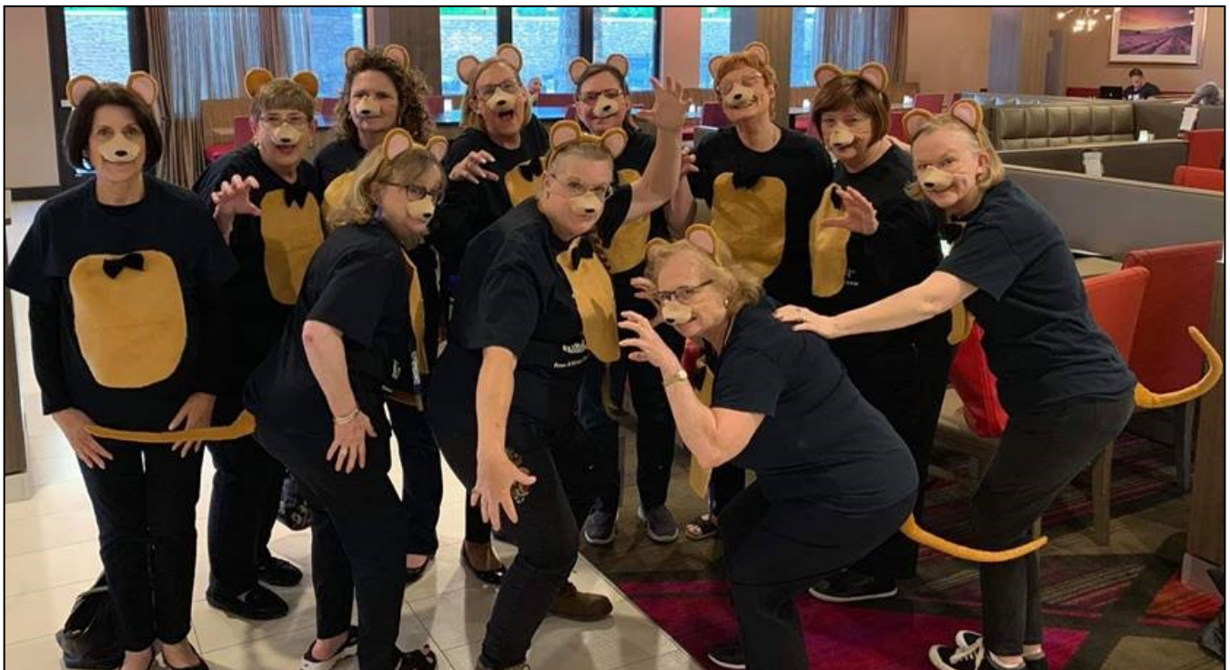
A few "monkey shines" from the Kindness Monkeys getting ready for Fun Night to begin. Now don't you wish you were there?