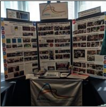
First Place Award for Club Display!