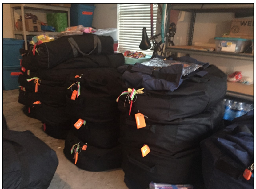
Right: Some of the bags packed with Days for Girls kits that are ready to be shipped to Africa