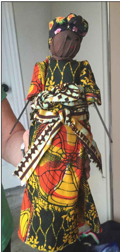
Above: an example of the water bottle dolls

In addition, volunteers are taking supplies to make cute little dolls for the children to play with and for their mothers to make to sell as a means of sustainability. This simple idea came about from observing a mother giving her daughter a plastic water bottle and saying "here's your baby—now go play with her." Hearing this, and knowing what it would mean for that little girl to have a real doll to play with, was all the motivation it took to create an embellished water bottle that looks like a doll. Not only are the dolls given to children as volunteers pass out Days for Girls kits, but they are also made and sold as souvenirs near locations frequented by tourists.