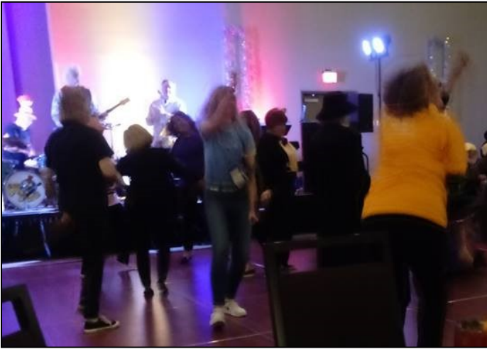
Great music and a chance to dance at Friday Fun Night.