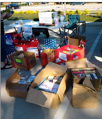
On October 27, books were collected at Heights Recreation Center

Also, we donated 7 boxes containing about 150 books for the Kindness Action Ninja project. Thank you to everyone for your support and encouragement during the successful completion of this project.