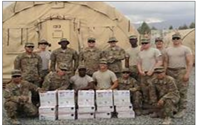
Pictured here are some of the troops displaying much needed and appreciated support “Care Packages”

On April 6, 2019, our members will gather at Friends Place at 9:00 am to fill, seal, address, and mail the boxes. Notes of encouragement will be included (with deepest thanks for their service) from the Kindness Ninjas of Altrusa Richardson.