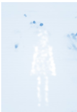
The female ghost on Black Bird Lane