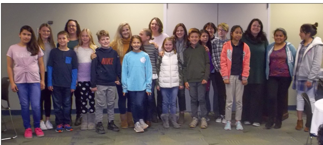
Top photo: The winners of the World Peace Art Contest show off their ribbons