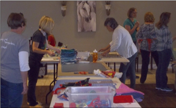
Altrusans cut, sewed and organize pieces of hygiene kits to be assembled for the Flower Mound High School service project.