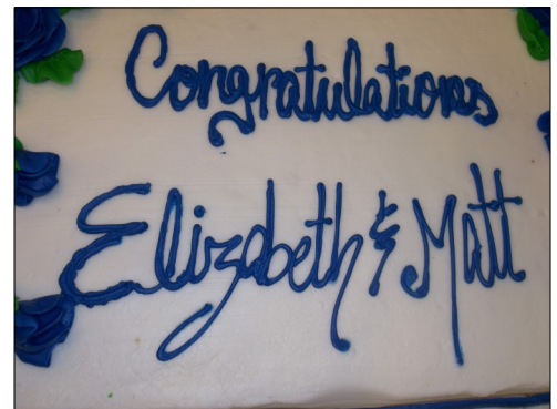
A photo of the wedding cake — And we add Congratulations from all of us!