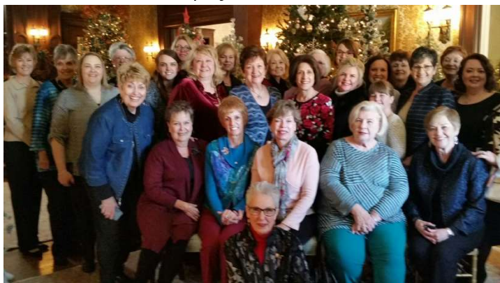
Richardson Altrusans and their guests.

Twenty-Three Richardson Altrusans and Sixteen Guests attended the Dallas Women's Forum European Tea Room on December 9 th . The Alexander Mansion was beautifully decorated, and the Chocolate Angel catered the Tea. The food and tea were delicious, and everyone toasted the holidays with the champagne. Each room was decorated in a different design. My favorite was a toss-up for between the Swan Lake Room and the Tiffany Room. Both were just stunning. We shopped at the vendors upstairs and toured the mansion after tea. Everyone had a wonderful time and we were able to support the Dallas Women's Forum local projects at the same time.