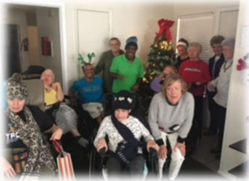
The Gang poses for a holiday pic