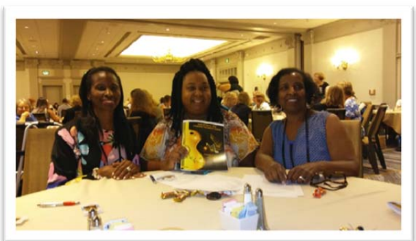
New ‘first timer’ friends from the Southwest Dallas County Club