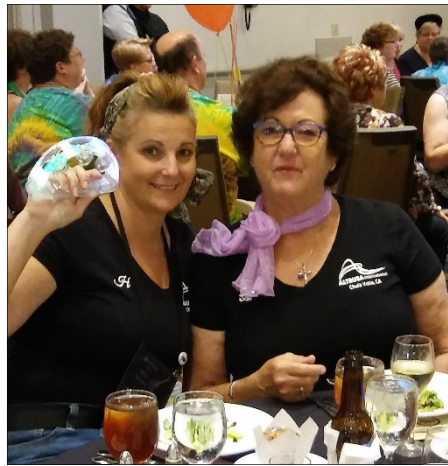
Chula Vista, CA club rocking to the 50's 1

been fighting for equal rights, equal pay, and the right to choose our own healthcare benefits without paying more than men. The battle has not been won, so keep fighting! And, not to be forgotten, the Downtown Dallas Club were fabulous in their flapper costumes.