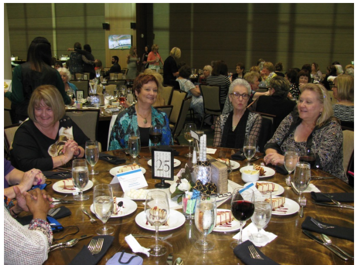
Group pictures below show Richardson Altrusans enjoying the glamour and friendship of the night.