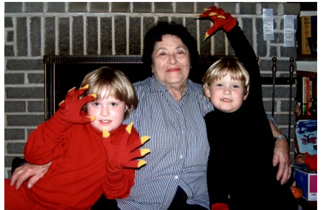
Patsy Palmer Reynolds Scholarship recipients pictured with their great-grandmother.