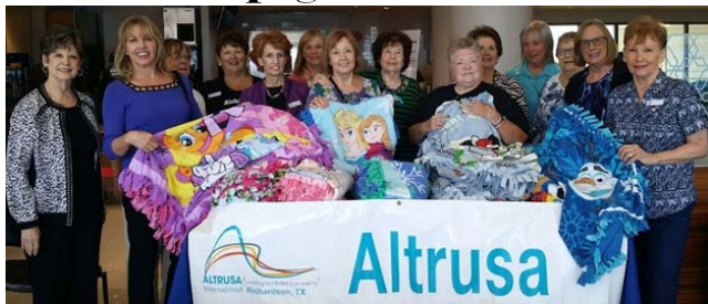
In April 2016, Richardson Altrusans donated hand-knotted blankets for the NICU at Methodist Richardson Medical Center

Altrusa International of Richardson, Inc. PO Box 832101 Richardson, TX 75083 contact@altrusarichardson.com www.altrusarichardson.com