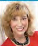
Outstanding Women of Today ... Builders of Tomorrow