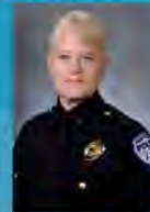
Outstanding Women of Today ... Builders of Tomorrow