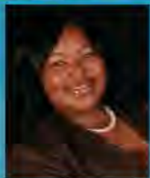
Outstanding Women of Today ... Builders of Tomorrow