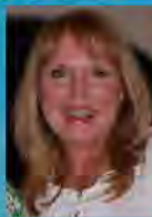
Outstanding Women of Today ... Builders of Tomorrow