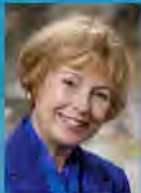
Outstanding Women of Today ... Builders of Tomorrow