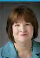
Outstanding Women of Today ... Builders of Tomorrow