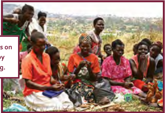
Ugandan beadmakers on hillside—Photo by Charles Steinberg.

The money raised at Bead for Life jewelry parties helps to raise awareness about the extreme poverty in Uganda and helps to share the inspiring stories of participants. The money raised is invested in community development work that not only fights poverty, but also helps in health care, vocational training, affordable housing, and entrepreneurial skill development. Please plan to arrive early to the March meetings to help connect with people worldwide in a circle of exchange that enriches everyone.