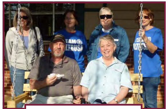
Camp Summit Clean Up 2011

Call Bobbi Klein for more information about Camp Summit.