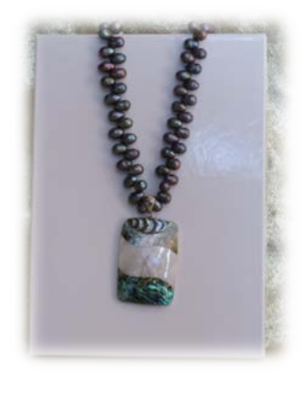
Custom Designed Necklace Value $65