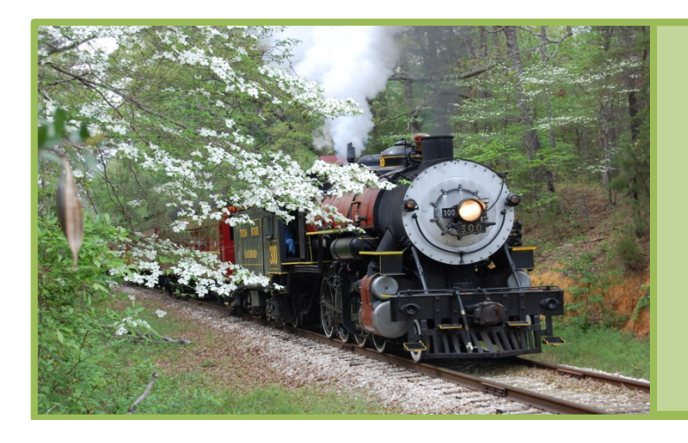
All Aboard District Nine Fall Leadership Train