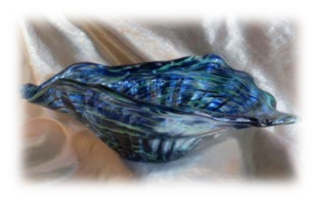
Decorative Lennox Crystal Bowl Value $75