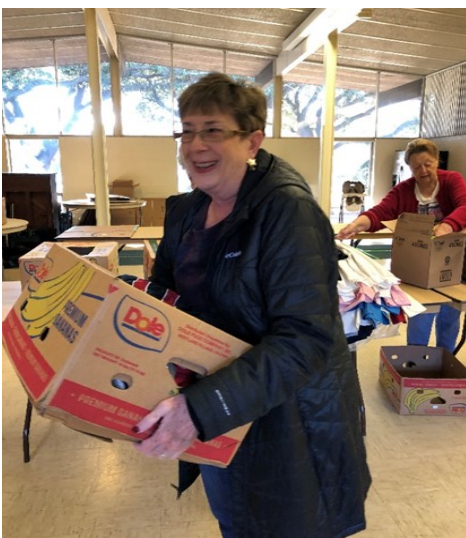
Another Altrusan helps with the loading.