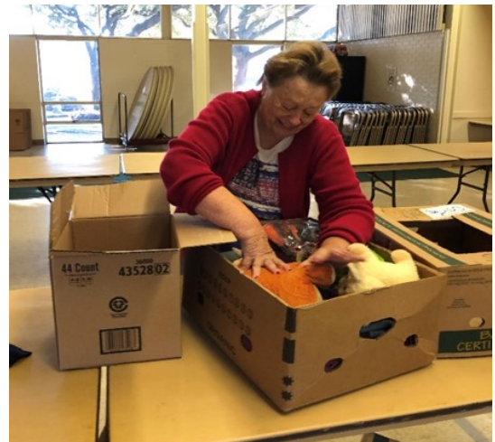
An Altrusan packs up some last minute donations to be loaded onto the truck