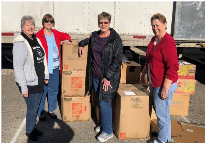
Four Altrusans proudly show off some of our boxes of to be packed on the truck