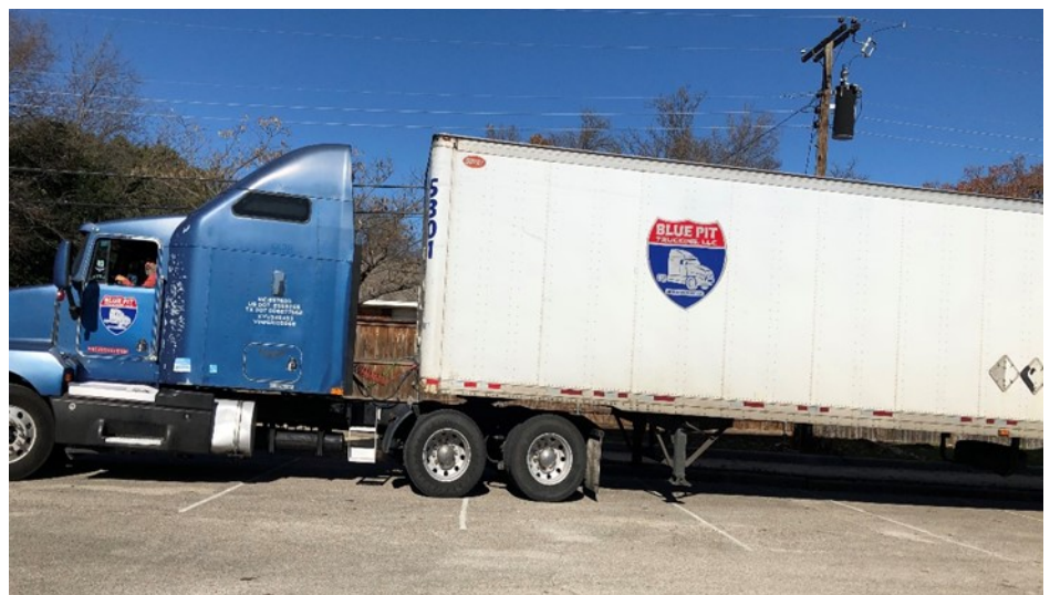
One of the two trucks leaves the parking lot bound for the Rio Grande.