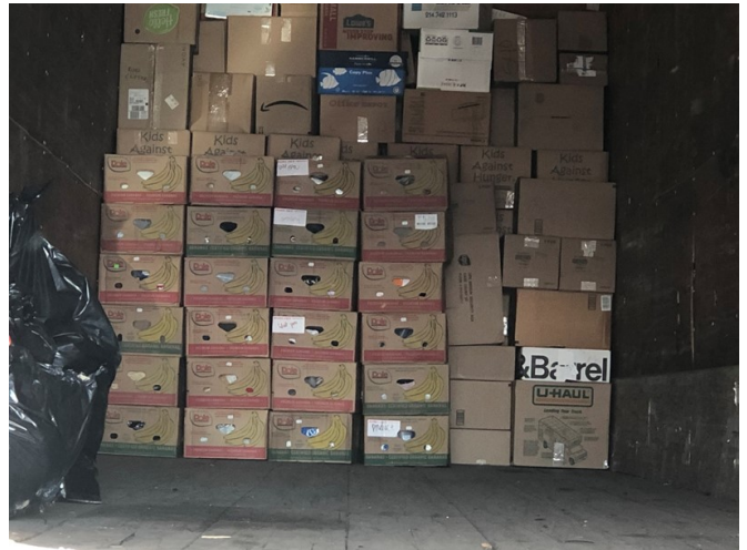
A shot of some of the 1500 boxes packed into one of the semi trucks bound Mexico