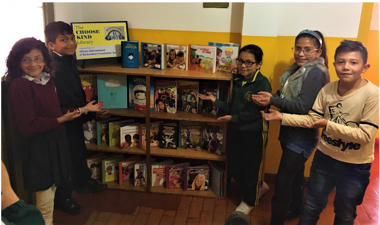
The Choose Kind Library in the El Puente Children's Home in Bogata, Columbia. They serve 65 children and this is their only library.