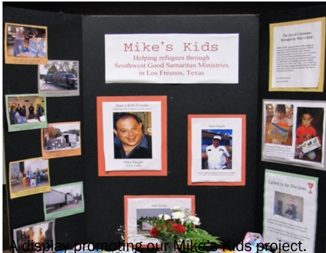
A display promoting our Mike's Kids project.