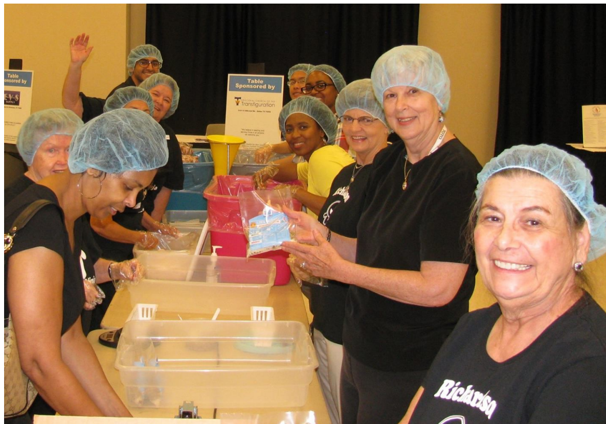
Eight Altrusans with other volunteers help pack 303 meals at an organized packaging day for "Feeding Children Everywhere". 25,000 meals were packed that day.