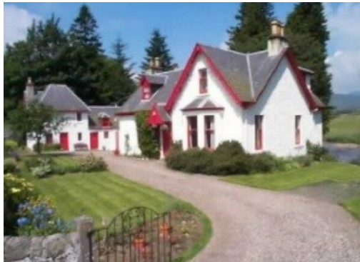
Corrydon Lodge Perthshire, Scotland